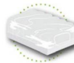
Wood pellet bags