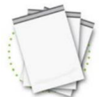
Plastic shipping envelopes